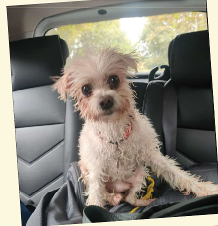
Ecki washed off all the horse dirt and went back to Sydney