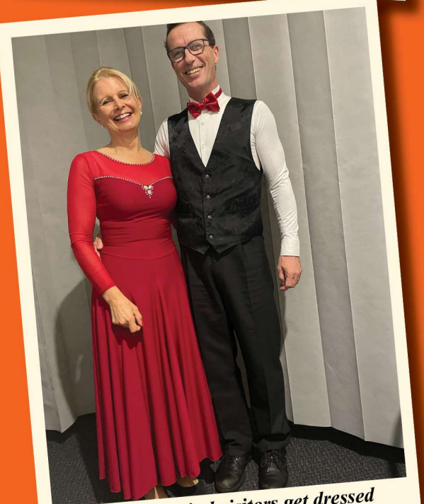
Some hospital visitors get dressed up to visit