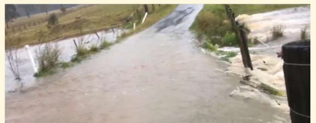
Entrance to HVEC