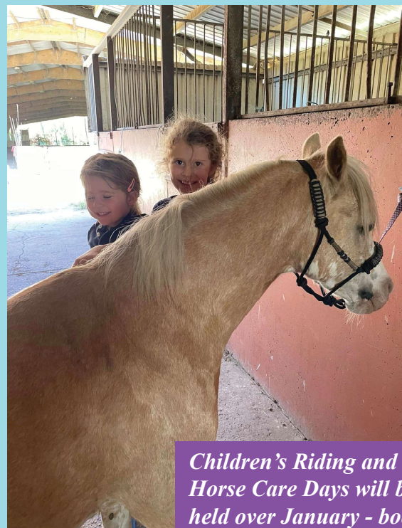
Children's Riding and Horse Care Days will be held over January - book in now!