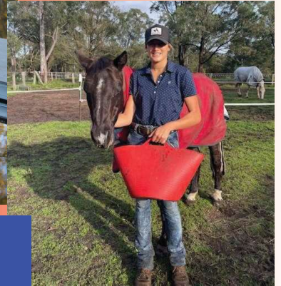
Welcome to HVEC Imogen