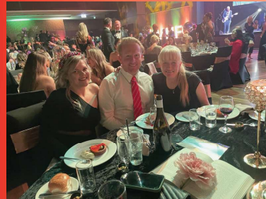
Mark Hughes Foundation Magic Ball